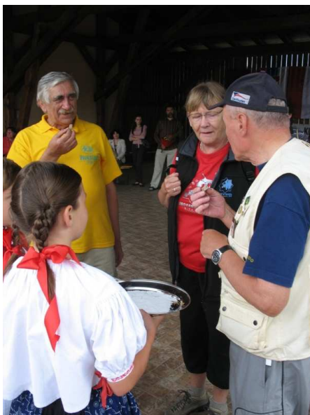
Salt and bread for welcome