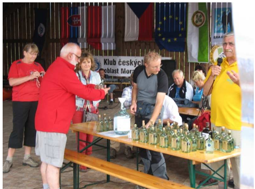
Water from Poland

It took a long time before it was all mixed in the big bottle, where it will represent this region in Andalusia. Some of the participants of this walks later will go to Andalusia themselves to be sure that the water will end up in the right place and to enjoy the big international get-together in Spain.