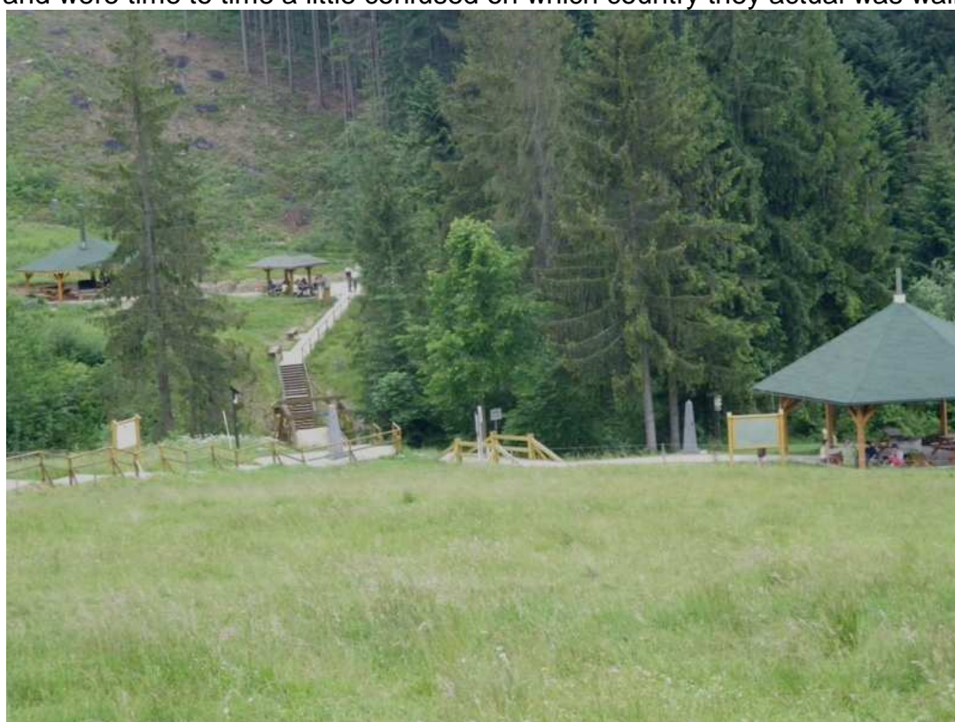
The borders between Poland Slovakia Czech Republic

All the walks took place in this border region. The participants crossed borders several times and were time to time a little confused on which country they actual was walking in.